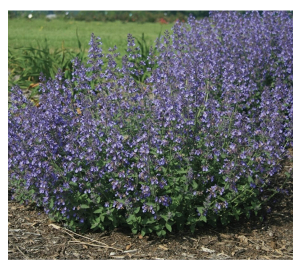
A sample of one of the plants available at the sale. Can you guess what it is? I know Lenora will know...

Will this be our best Plant Sale ever? It's in Mother Nature's hands. Could we please have four days of perfect weather?!