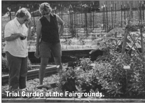
Trial Garden at the Fairgrounds.

The trial garden was originally started at the Fairgrounds in 2000. After moving around for a number of