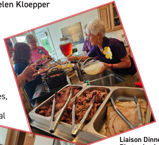
Liaison Dinner