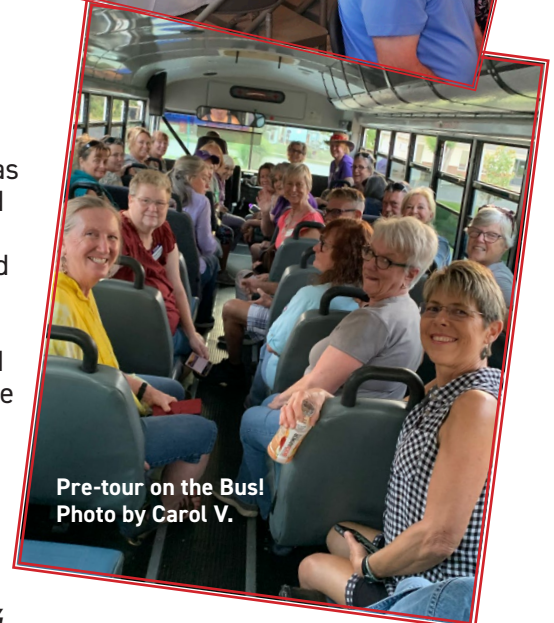
Pre-tour on the Bus!