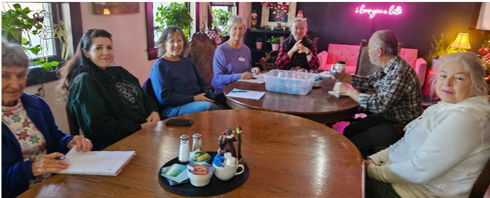
Some of the members attending the meeting held at the Jackson Hotel.

We would love to have more gardeners to join us to marvel at the beauty, exercise our minds and backs, and enjoy lively discussions about our passion for gardening and the community.