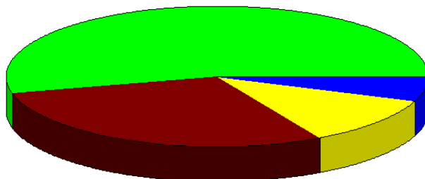
Expense Summary January through December 2019